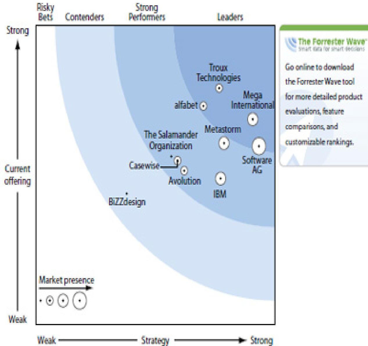
Figure 2 Forrester Wave™: Enterprise Architecture Management Suites, Q2 '11